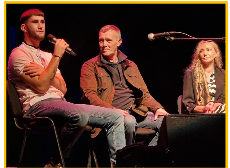
Traveller Pride event in Glor