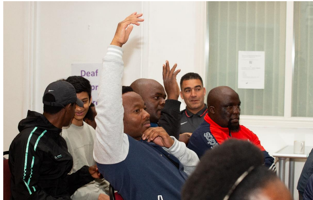
Public consultation with people living in direct provision

The peer-led focus groups for the Pobal-funded LECP research and training project concluded in this quarter. A submission was made to Clare County Council on the Plan's strategic goals (see 'Submissions'), based on the research conducted. Clare PPN continues to liaise with Clare County Council and other stakeholders on the LECP steering group, helping to guide the final draft which will go out for six weeks of public consultation before the end of this year. Meanwhile a new publication from Clare PPN and TASC- a Think-tank for Action on Social Change called 'Fair Clare – securing socio-economic rights and a just transition in Clare' will be launched in November 2023 and Clare PPN will be presenting key transferrable lessons from it at Pobal's 'Inclusive Community Engagement Showcase'