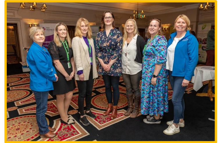
Connecting Communities event