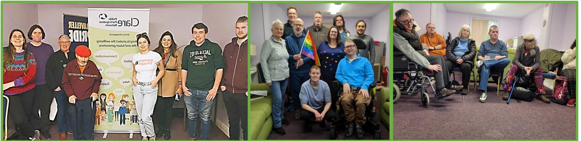
L-R: CATU Clare Training Event, Quare Clare Steering Group Meeting, Clare Leader Forum Strategy Day