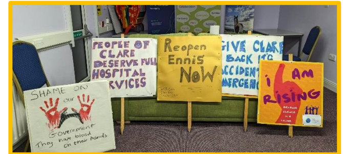
Signs for Mid-West Hospital campaign