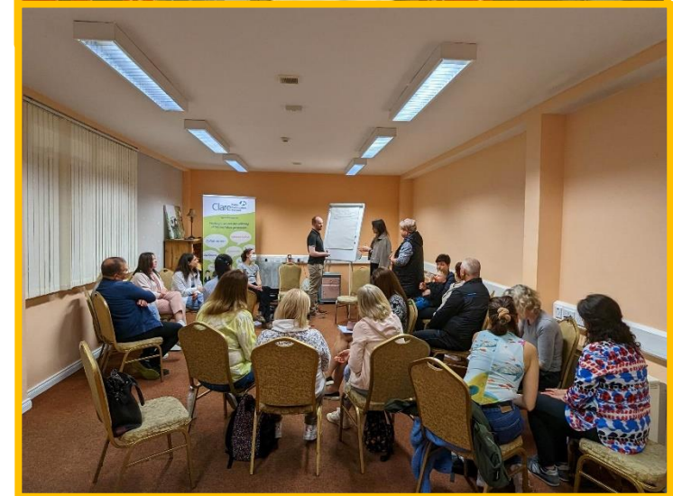
TOP: Just Transition event in Templegate Hotel, Ennis