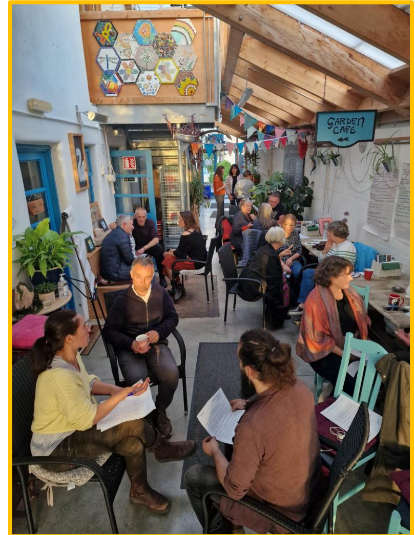
Just Transition Workshop and brainstorming session at East Clare Community Co-op, Scariff

If you have any questions or comments, please contact 087 1617375 or sarah@clareppn.ie