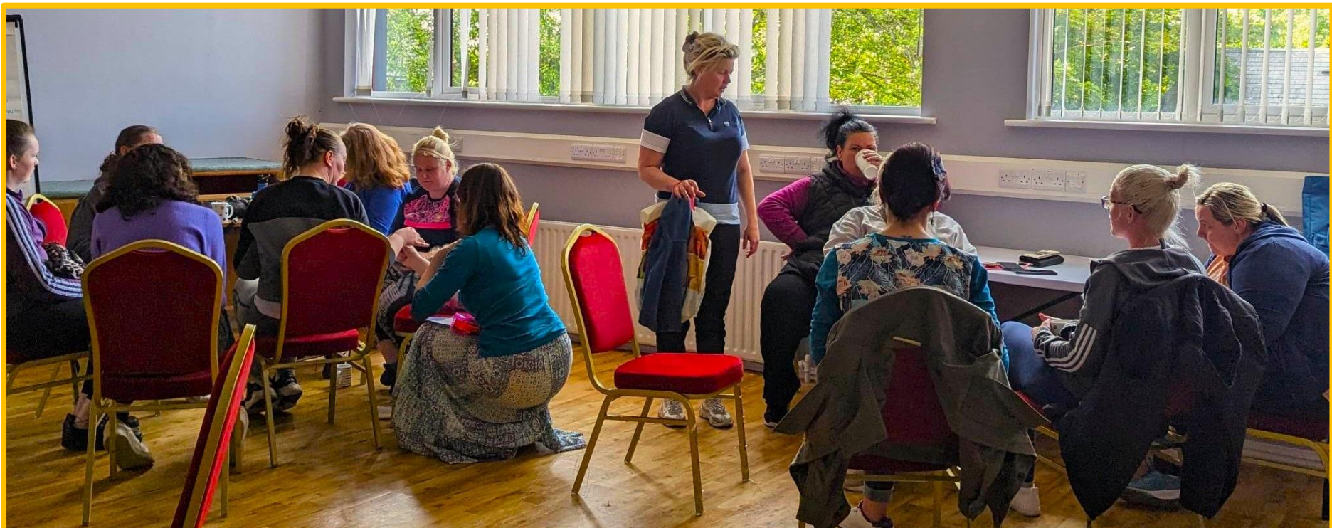
LECP Project Focus Group in Kilrush Family Resource Centre

This project has been a huge focus of Clare PPN's work in the last quarter with the help of funding from Pobal through the Dormant Accounts fund, and will inform not just the LECP but will be of huge benefit to all policy and decision-makers when drawing up future plans.