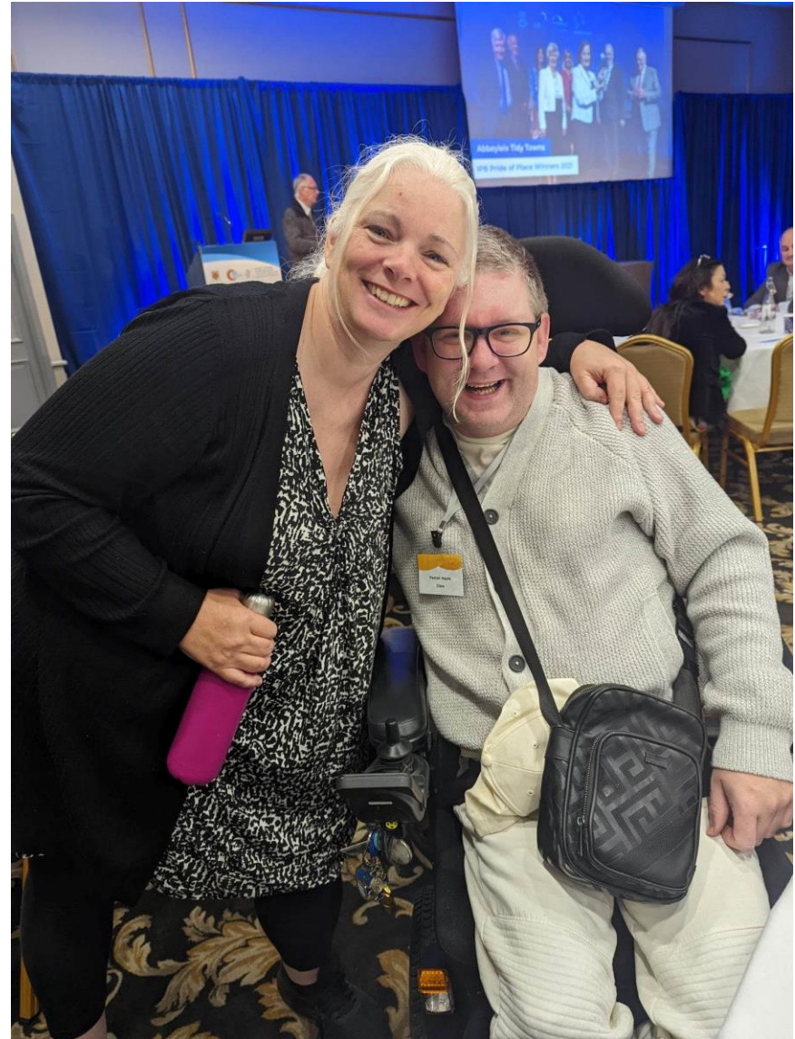
Photos of our fantastic Secretariat members from the National PPN conference.