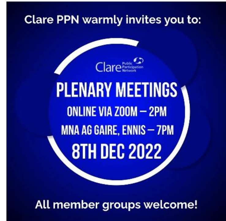
Poster for December's plenary meetings