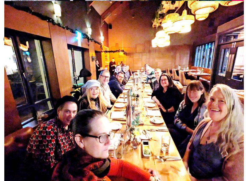
Quare Clare Christmas Party