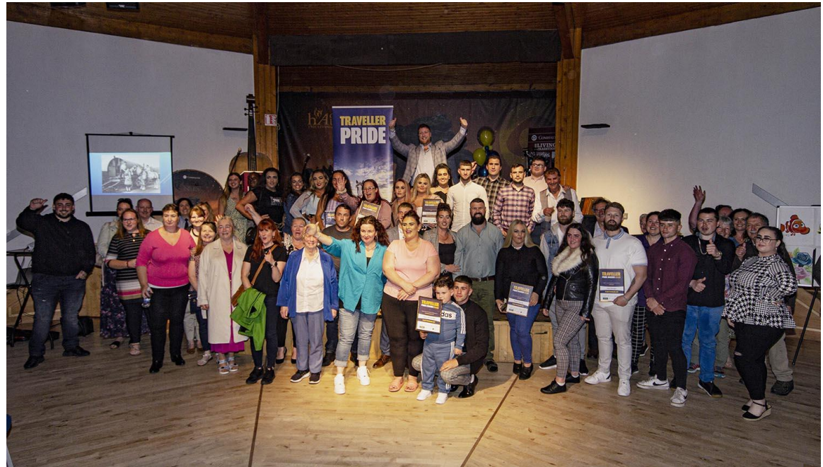
Traveller Pride Awards

Clare PPN is a steering group member of Clare Traveller CDP