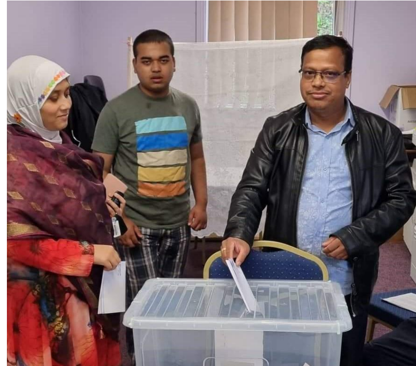
Bangladeshi community casting ballots for national representatives

Opinion piece: https://www.irishexaminer.com/opinion/commentanalysis/arid-40965605.html