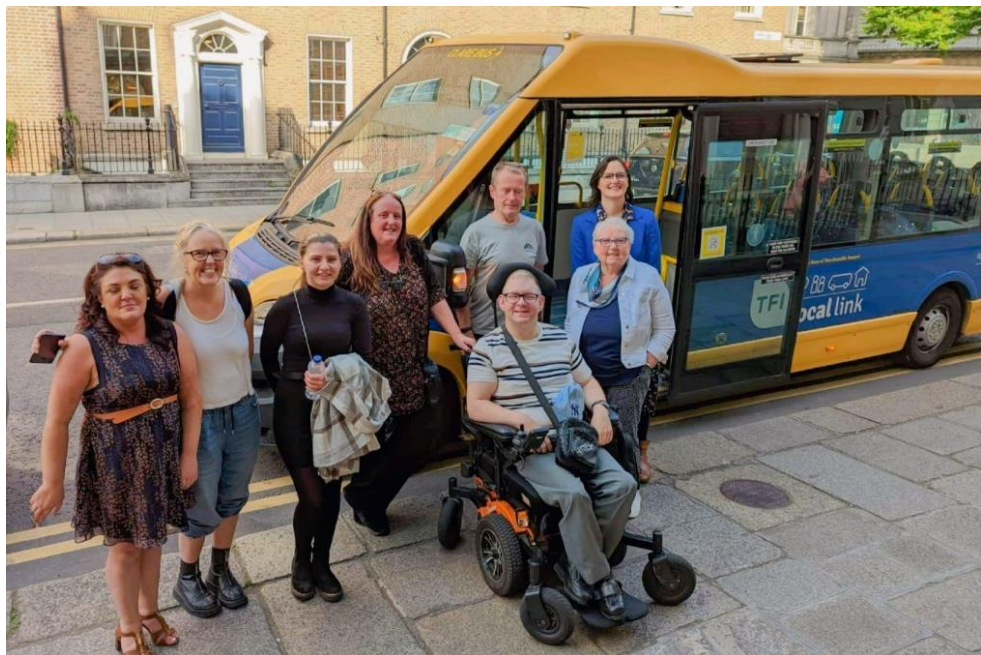
Clare Anti-Poverty Strategy launch day in Dublin