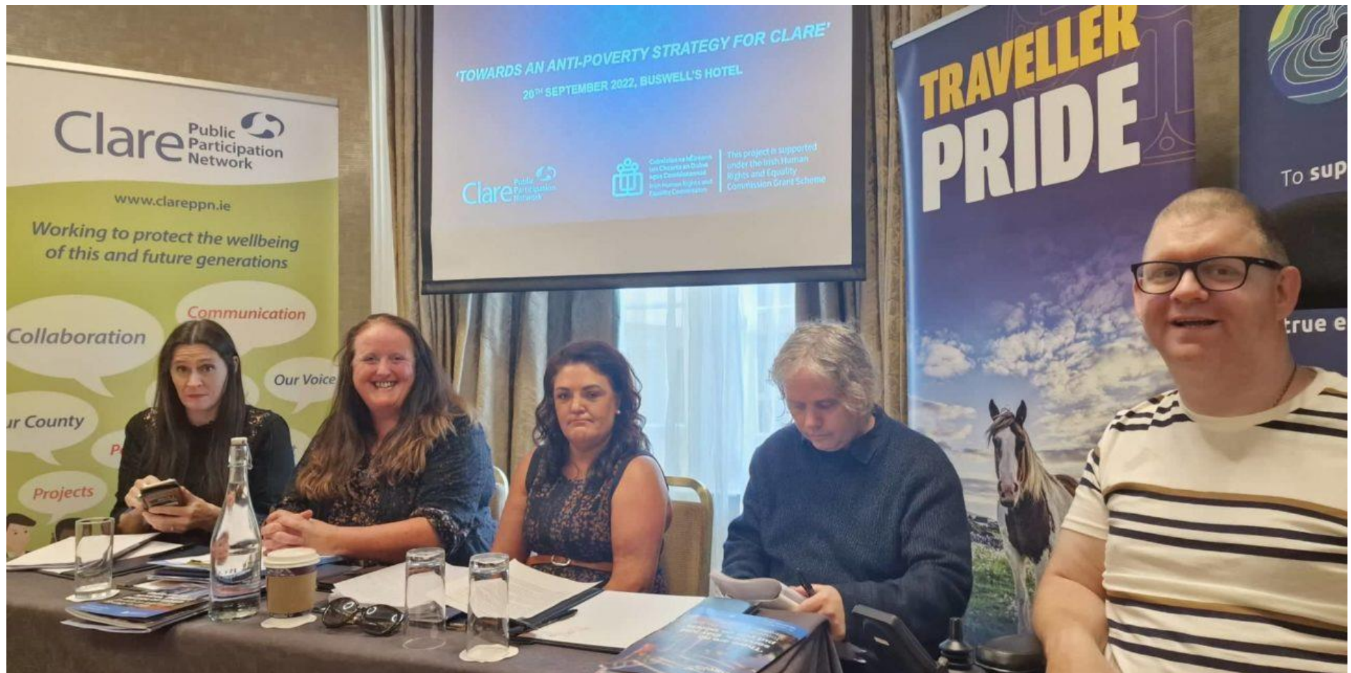
Anti-Poverty Strategy Launch at Buswell's Hotel, Dublin on 20 th September 2022