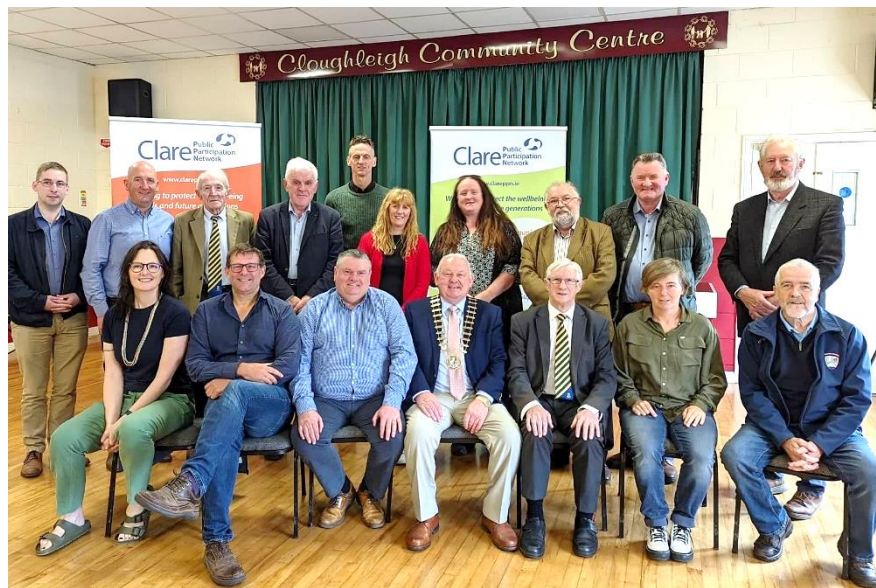
Clare Anti-Poverty Strategy session with elected Councillors