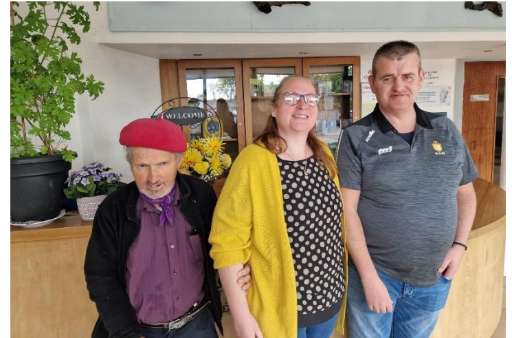
Clare PPN Secretariat members and reps at Clare Leader Forum's film premier