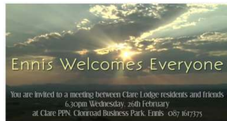
(Poster for EWE meeting)

Ennis Welcomes Everyone had its first public meeting, inviting the residents of Clare Lodge and longer term residents of the town to get together in friendship and solidarity. Unfortunately the meetings have now had to be curtailed but will be resumed once restrictions are lifted.