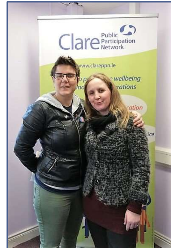
Promoting free rapid Hep c & HIV testing