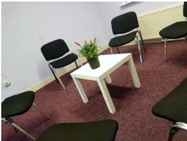
The new premises in transition